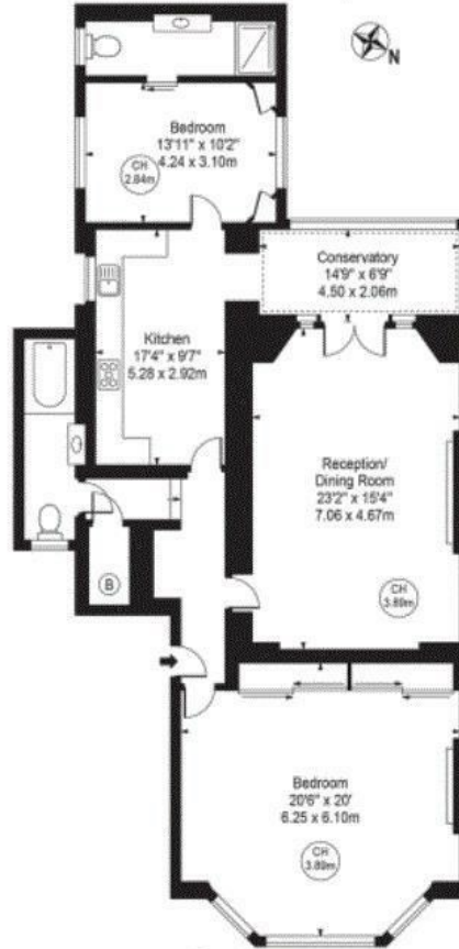
Ground Floor For Illustration Purposes Only - Not To Scale

This floor plan should be used as a general outline for guidance only and does not constitute in whole or in part an offer or contract. Any intending purchaser or lessee should satisfy themselves by inspection, searches, enquiries and full survey as to the correctness of each statement. Any areas, measurements or distances quoted are approximate and should not be used to value a property or be the basis of any sale or let.