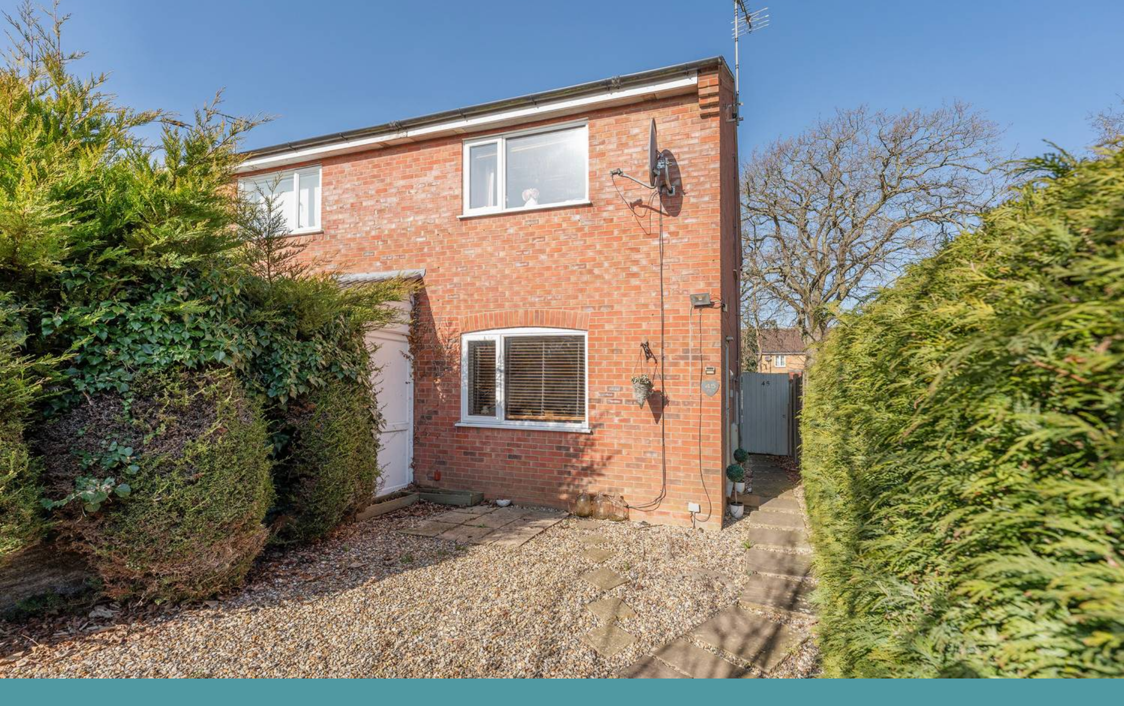
45 William Way, Dereham