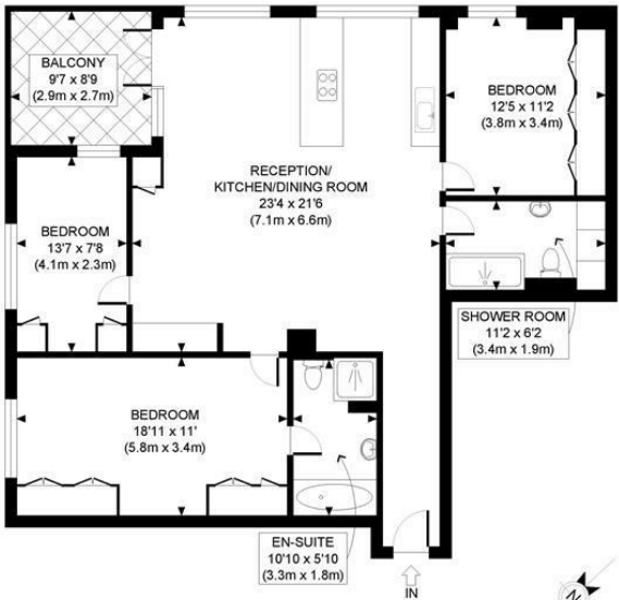
FIRST FLOOR GROSS INTERNAL FLOOR AREA 1157 SQ FT APPROX. GROSS INTERNAL FLOOR AREA: 1157 SQ FT/ 107 SQM

PROPERTY PHOTO PLANS ONE STOP SHOP FOR PROPERTY MARKETING