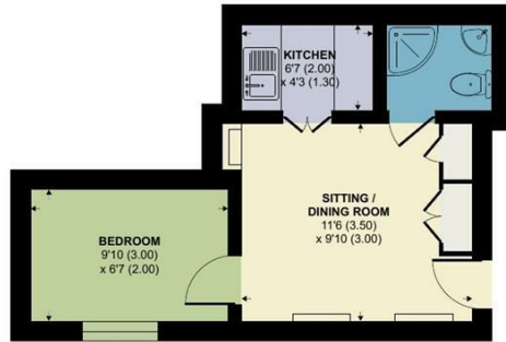
GROUND FLOOR 15D