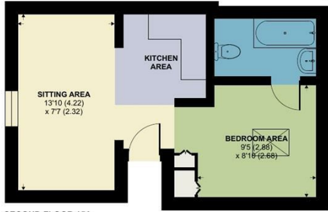
SECOND FLOOR 15A