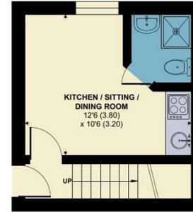
FIRST FLOOR 15C

This floor plan was constructed using measurements provided to © nrichcom 2025 by a third party. Produced for Symonds & Sampson. REF: 1222647