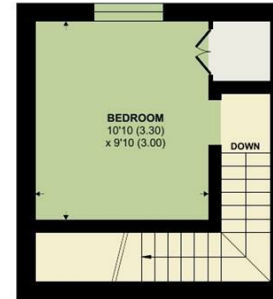
SECOND FLOOR 15C