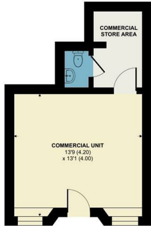
GROUND FLOOR 17