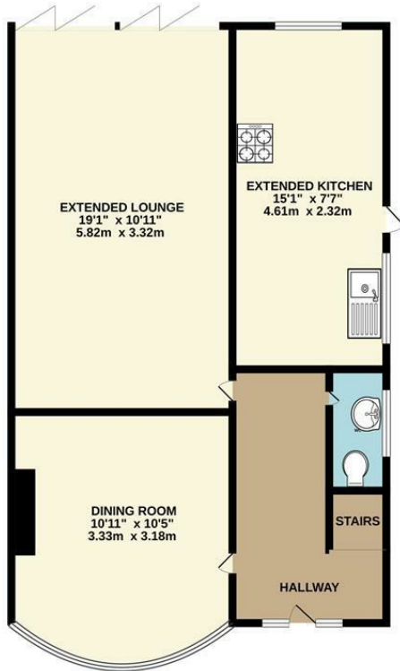
GROUND FLOOR 575 sq.ft. (53.4 sq.m.) approx.