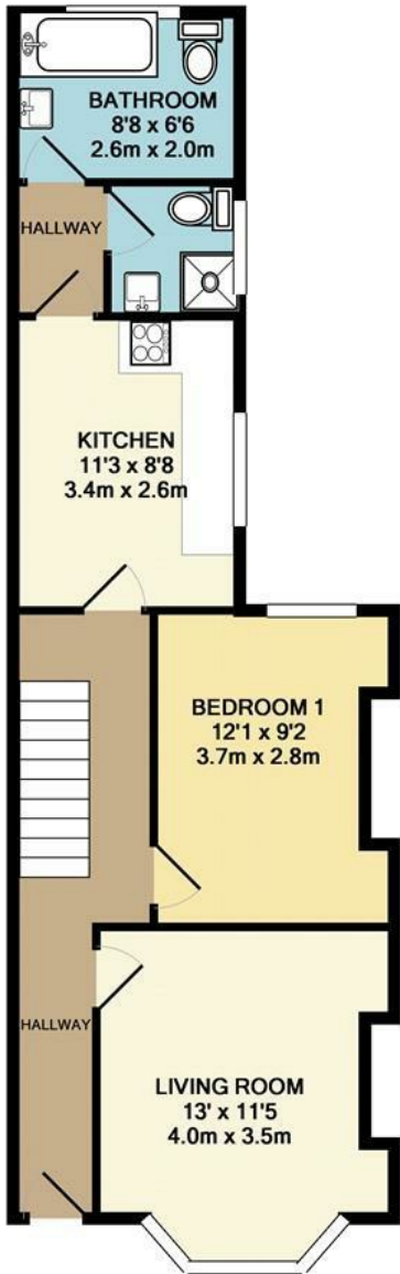
GROUND FLOOR APPROX. FLOOR AREA 49.7 SQ.M. (535 SQ.FT.)