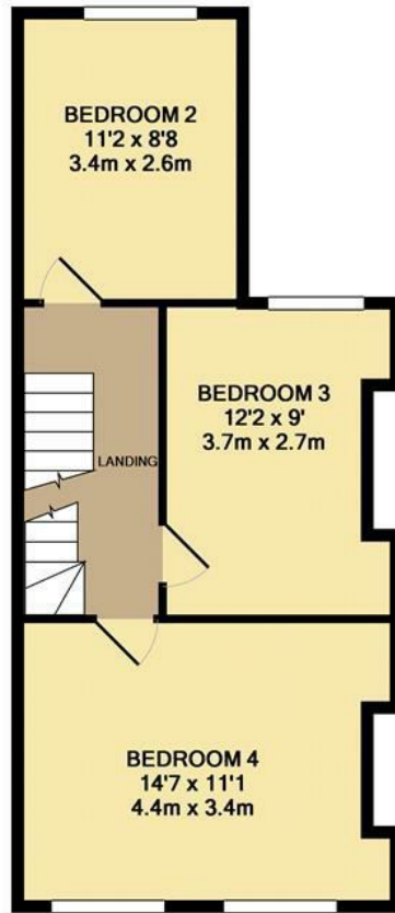
1ST FLOOR APPROX. FLOOR AREA 39.3 SQ.M. (423 SQ.FT.)