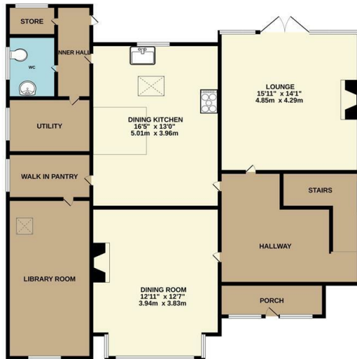
GROUND FLOOR 1074 sq.ft. (99.8 sq.m.) approx.