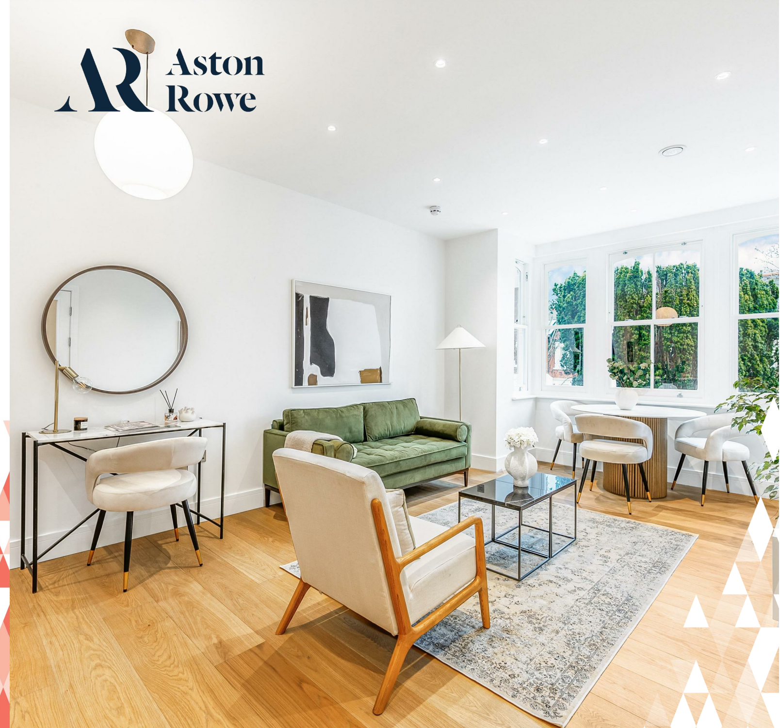
Twyford Avenue Approximate Gross Internal Area = 65.8 sq m / 708 sq ft