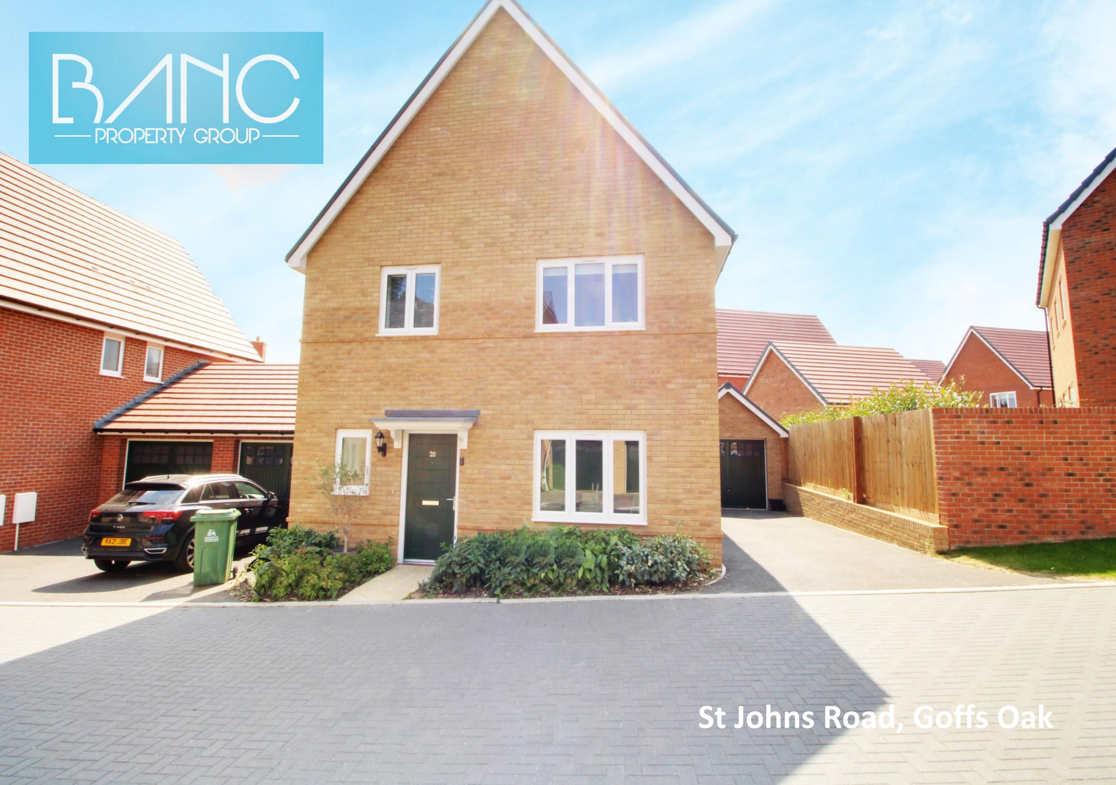
St Johns Road, Goffs Oak