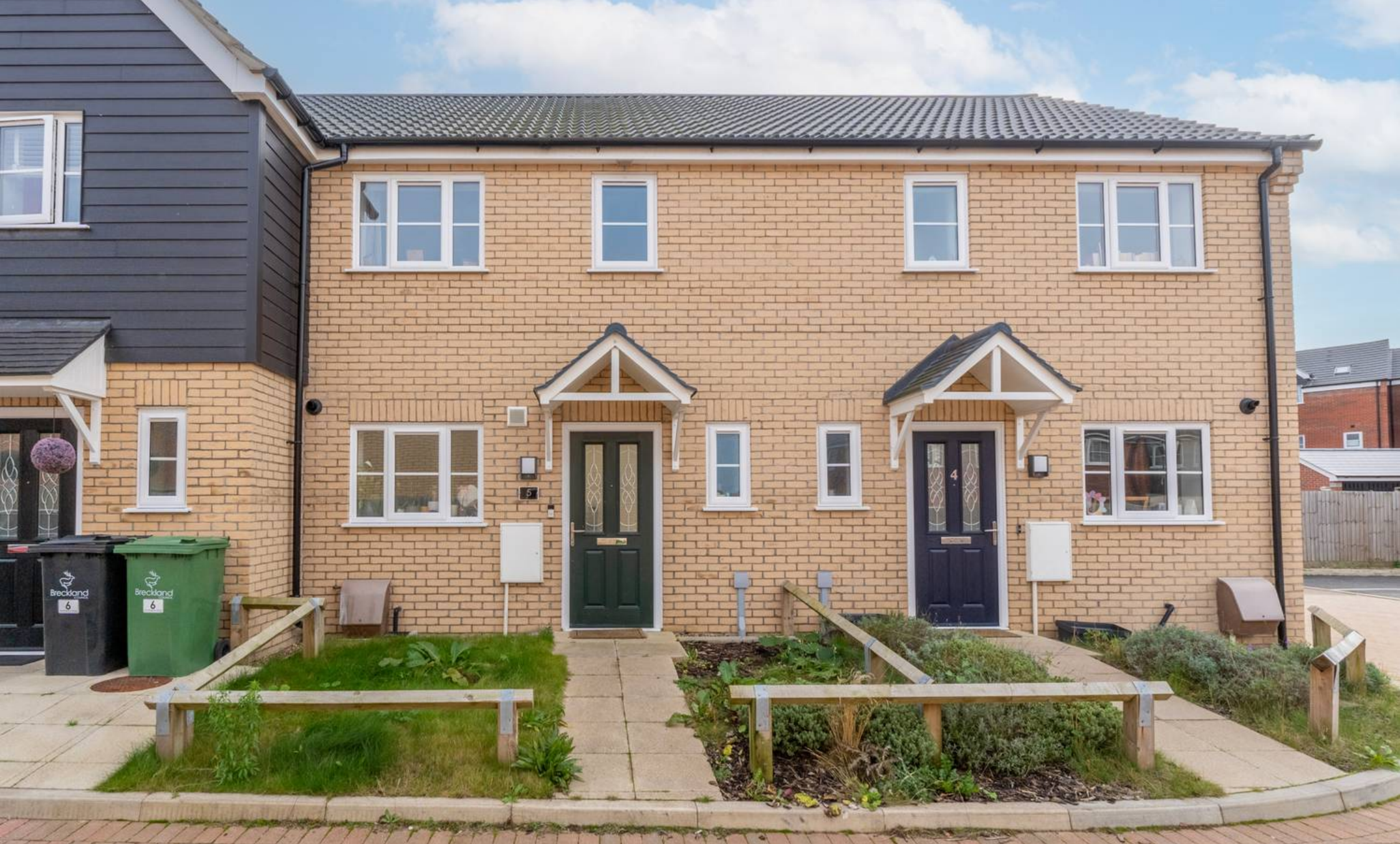
5 Buckingham Close, Carbrooke £210,000