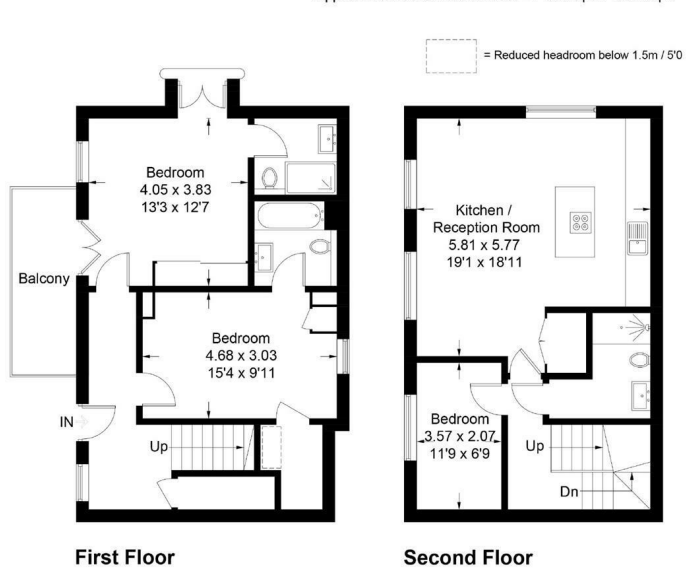
Illustration for identification purposes only, measurements are appro

Approximate Gross Internal Area = 116.5 sq m / 1254 sq ft