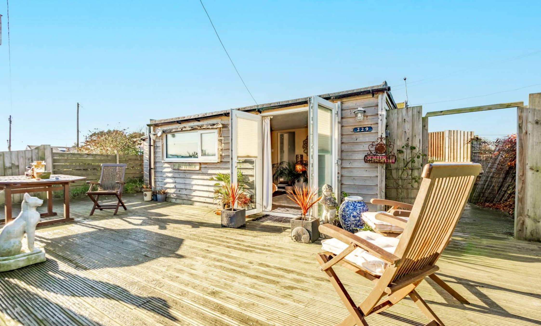
229 The Marrams, Hemsby £105,000