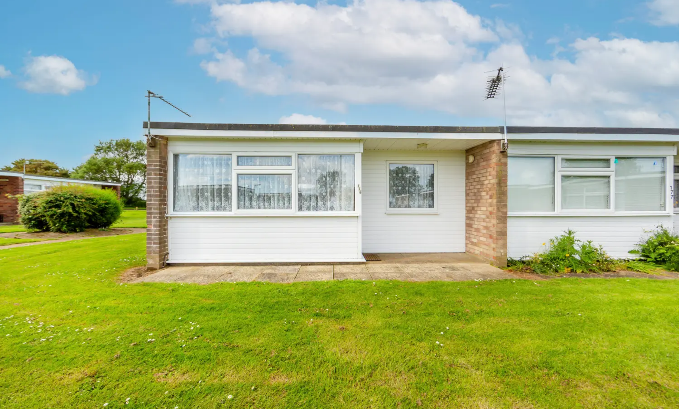
176 Sunbeach Holiday Park, California Road, Great Yarmouth