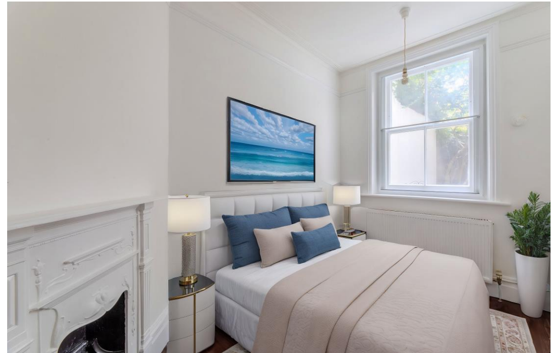
All photos are digitally Staged - The property is empty