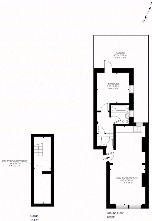
Beryl Road, W6 Approximate Gross Internal Area 55.93 SQ.M / 602 SQ.FT

Beryl Road is a short walk to the river and Thames Path, the excellent shopping and amenities at Hammersmith Broadway, as well as all the new bars and restaurants at the Fulham Reach and Riverside Studios developments, including Brasserie Blanc, Sam's Riverside, The Crabtree gastropub, The Blue Boat and many more. With no onward chain, early viewing of this lovely property is highly recommended