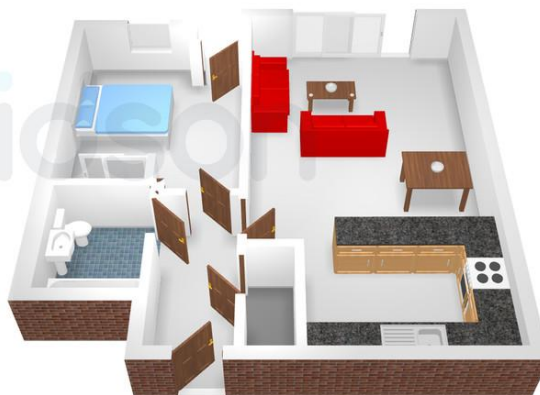
Floorplan measurements are for illustrative purpose only. Floor plan by www.sebastiano.co.uk.