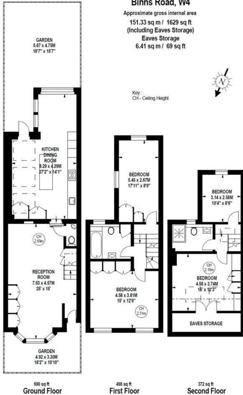
690 sq ft Ground Floor

Approximate gross internal area 151.33 sq m / 1629 sq ft (Including Eaves Storage) Eaves Storage 6.41 sq m / 69 sq ft