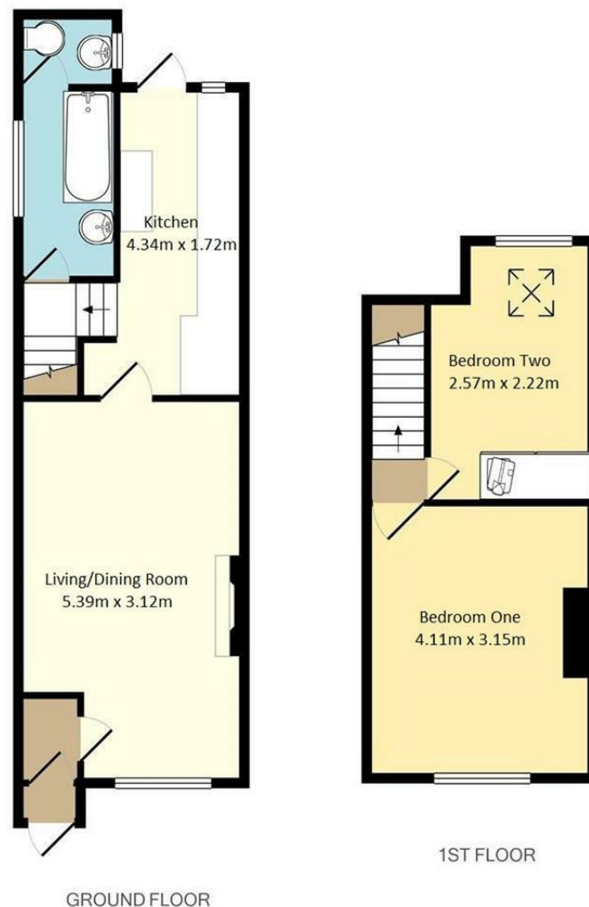
This Floor Plan is for guidance only and is NOT to SCALE Made with Metropix ©2021