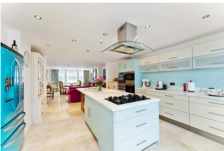
Hornsey Lane, Highgate Village, N6 £3,400,000 Freehold