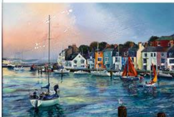
Cover: Olivia Nurrish olivianurrish.com

There is always the possibility of last minute withdrawals or sales prior. Please ensure you have registered your interest and we will endeavour to contact you if the lot is withdrawn or likely to be sold prior to the auction.