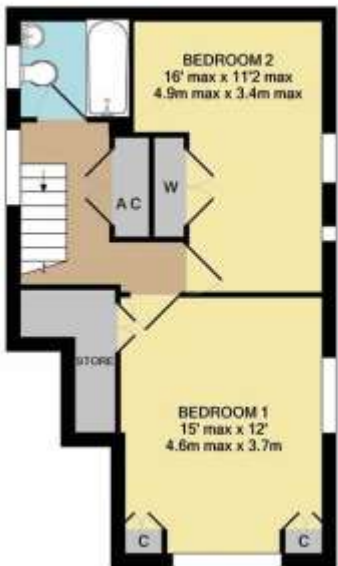
1ST FLOOR APPROX. FLOOR AREA 491 SQ. FT. (45.7 SQ.M.)