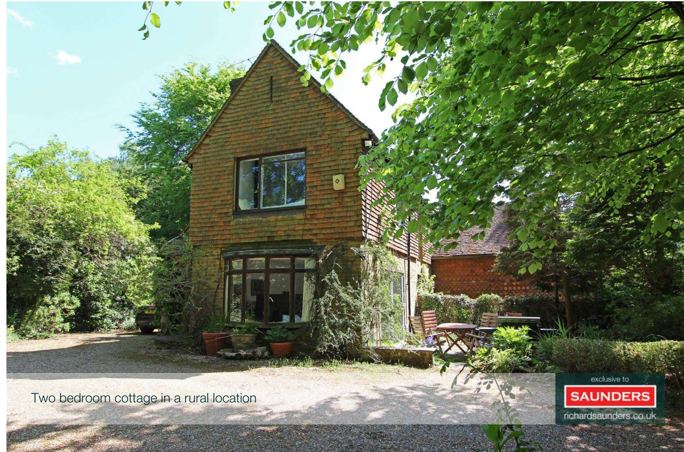
Two bedroom cottage in a rural location

exclusive to SAUNDERS richardsaunders.co.uk