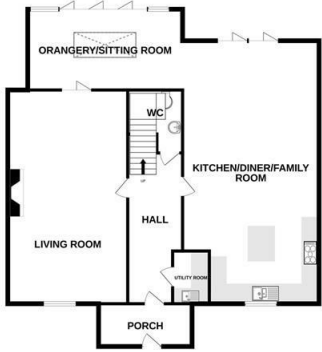
GROUND FLOOR 2129 sq.ft. (197.8 sq.m.) approx.