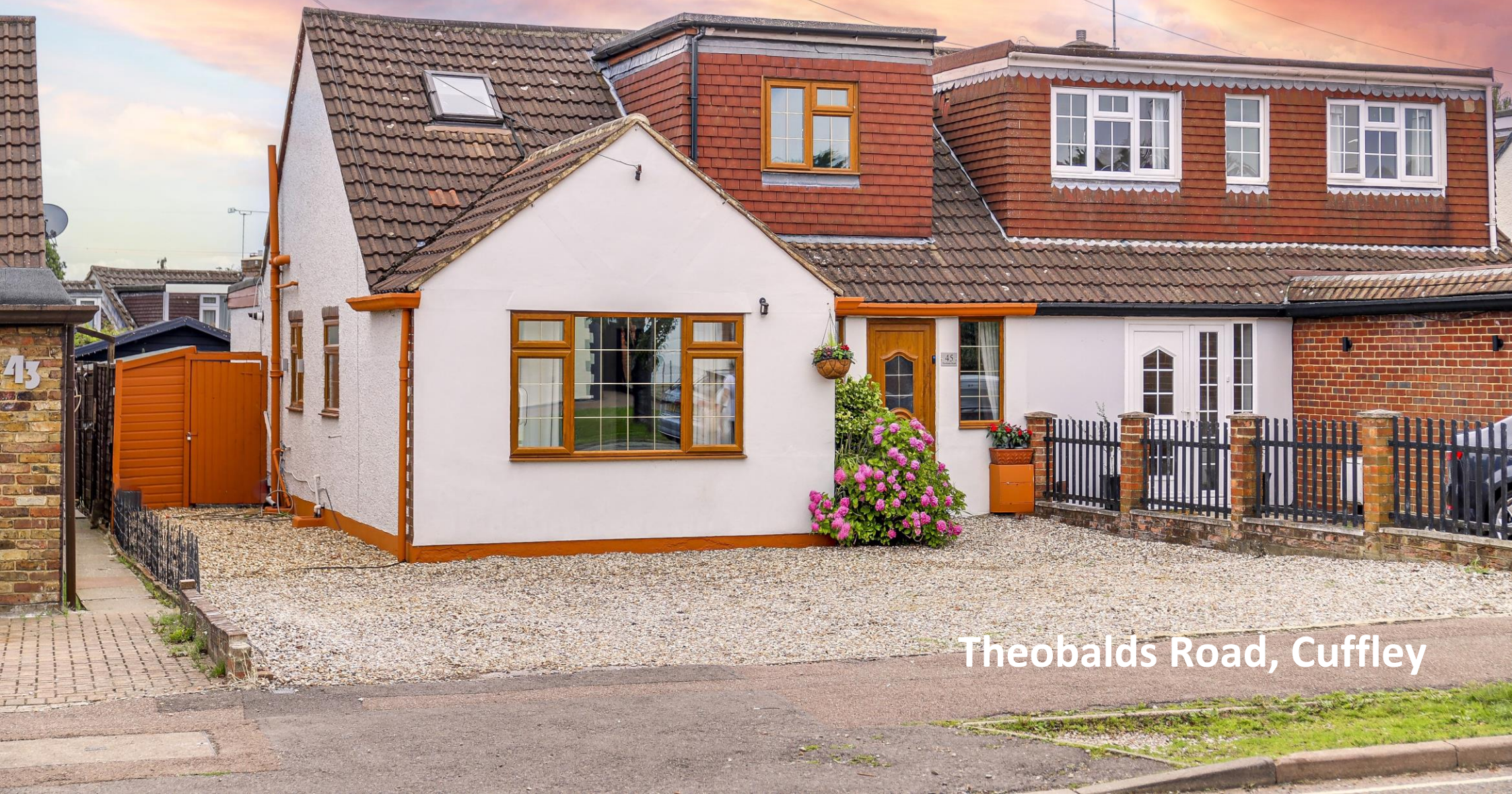
Theobalds Road, Cuffley