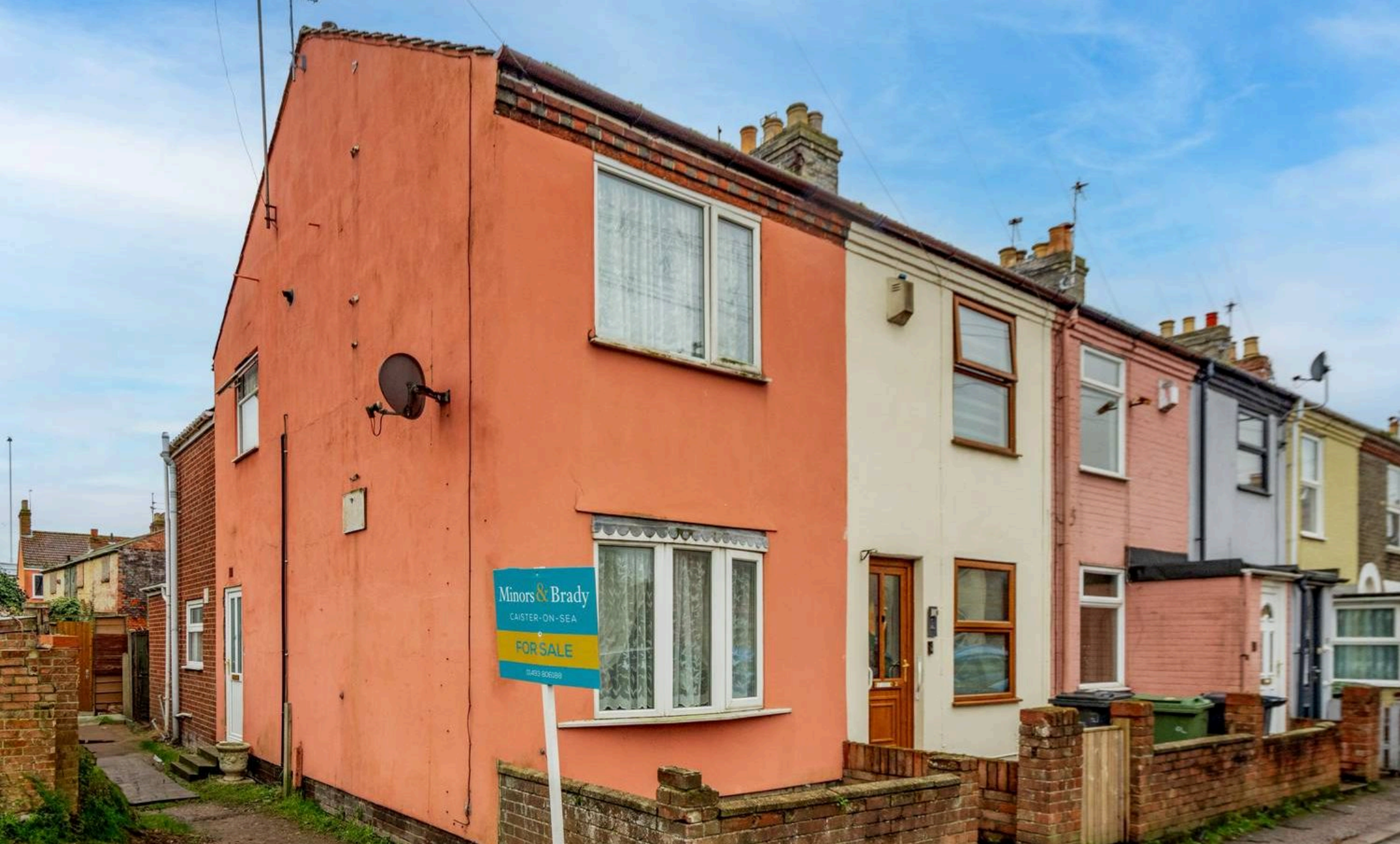
1 Waveney Road, Great Yarmouth £120,000