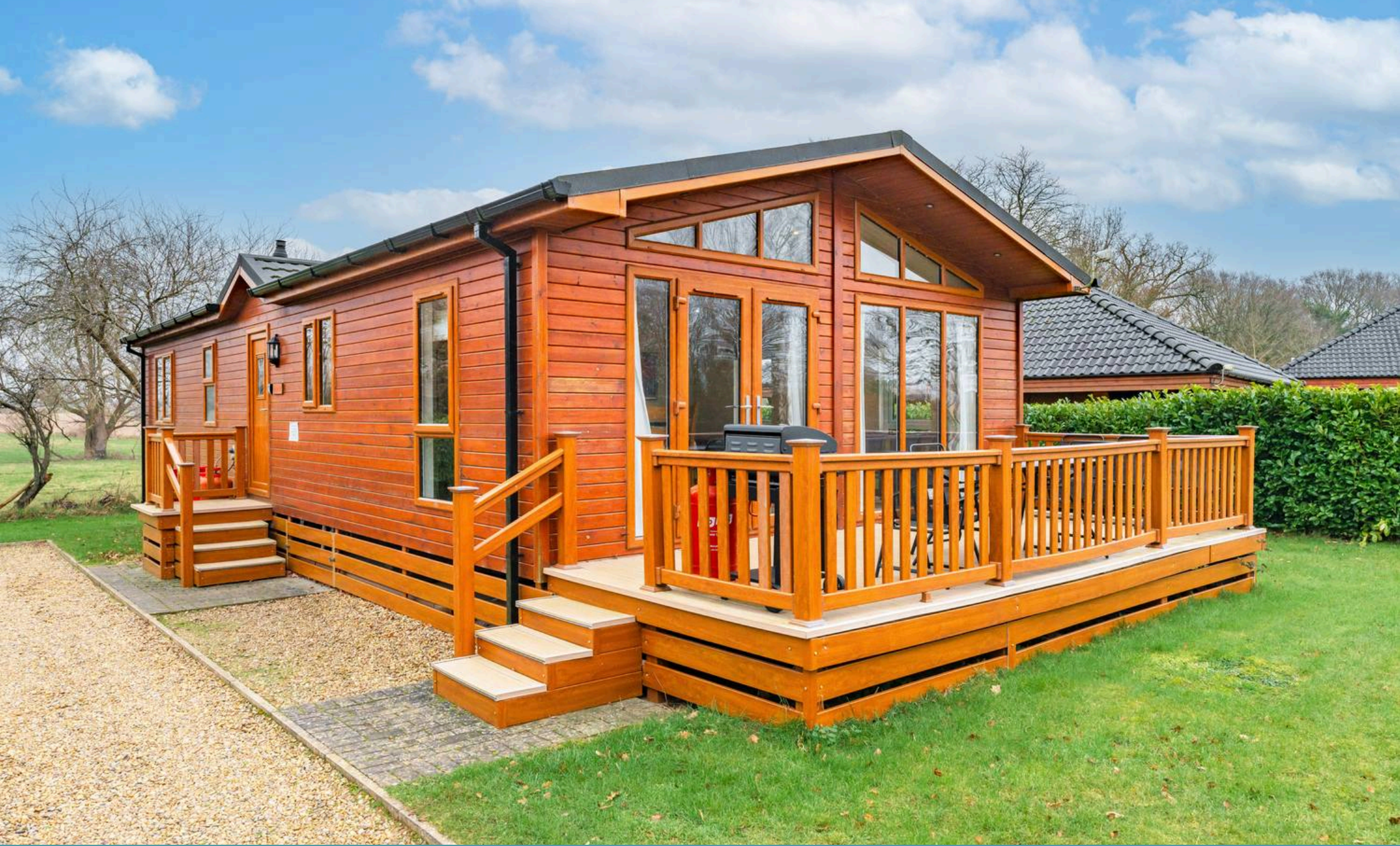
Bittern Lodge, Old Church Road, Langmere Lakes £210,000