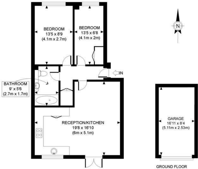
GROUND FLOOR GROSS INTERNAL FLOOR AREA 608 SQ FT

APPROX. GROSS INTERNAL FLOOR AREA: 608 SQ FT/ 56 SQM