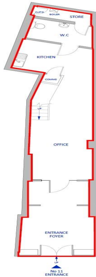
KNIGHTSBRIDGE GREEN GROUND FLOOR