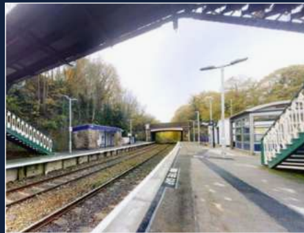
New Mills / Newtown Station (400m)