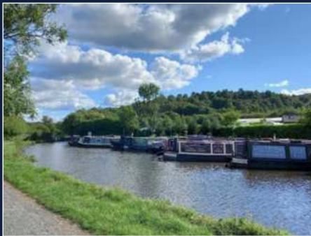
New Mills Marina (500m)