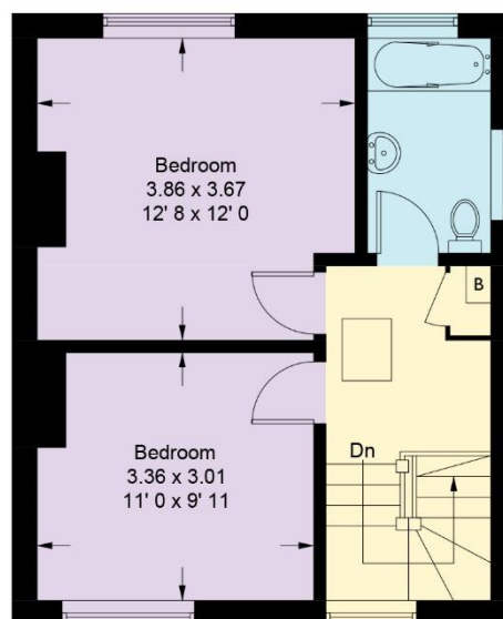
First Floor 402 sq ft / 37.4 sq m

This plan is not to scale and must be used as layout guidance only. All measurements and areas are approximate and should not be relied upon to provide accurate information. This plan must not be relied upon when making property valuations, design considerations or any other such relevant decisions. We accept no responsibility or liability (whether in contract, tort or otherwise) in relation to any loss whatsoever arising from or in connection with any use of this plan or the adequacy, accuracy or completeness of it or any information within it.