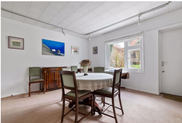
Addison Way, Hampstead Garden Suburb, NW11 Freehold £1,150,000