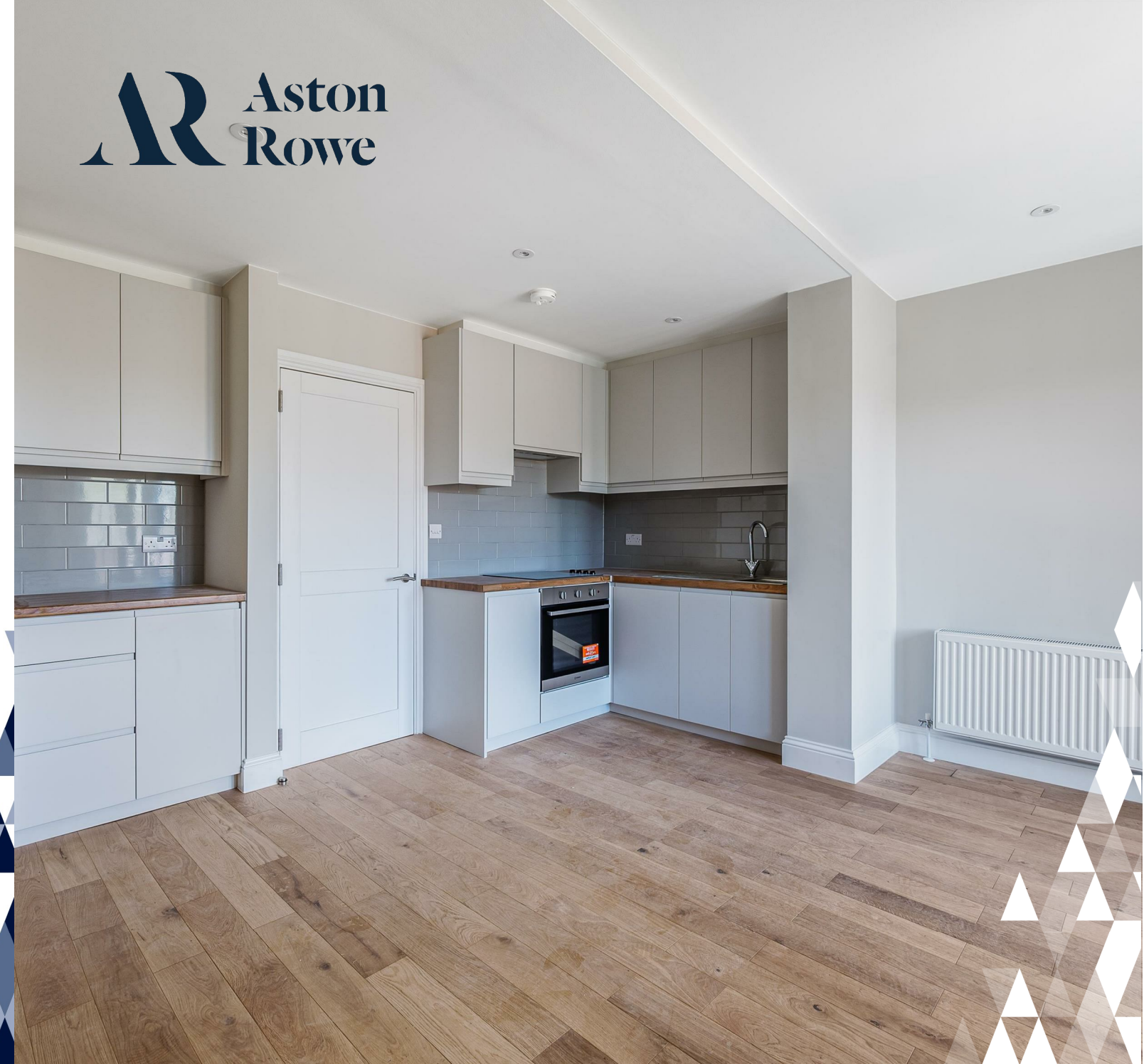
Berrymead Gardens Approximate Gross Internal Area = 37 sq m / 398 sq ft