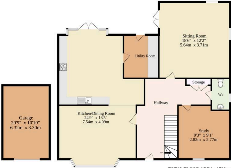
Ground Floor 1087 sq.ft. (101.0 sq.m.) approx.