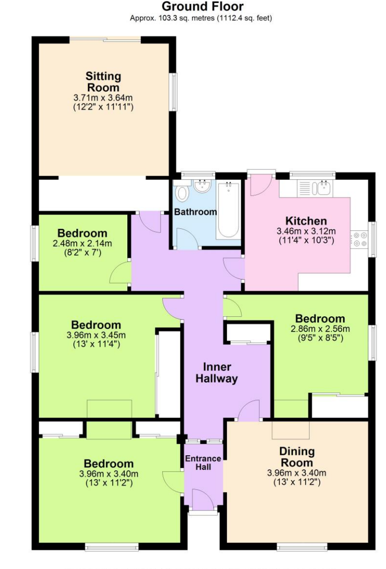
Total area: approx. 103.3 sq. metres (1112.4 sq. feet) Although every attempt has been made to ensure the accuracy of this floorplan measurements of doors, windows, rooms and any other items are approximate and no responsibility is taken for any error, omission or mis-statement. This plan is for illustrative purposes only. Plan produced using PlanLb