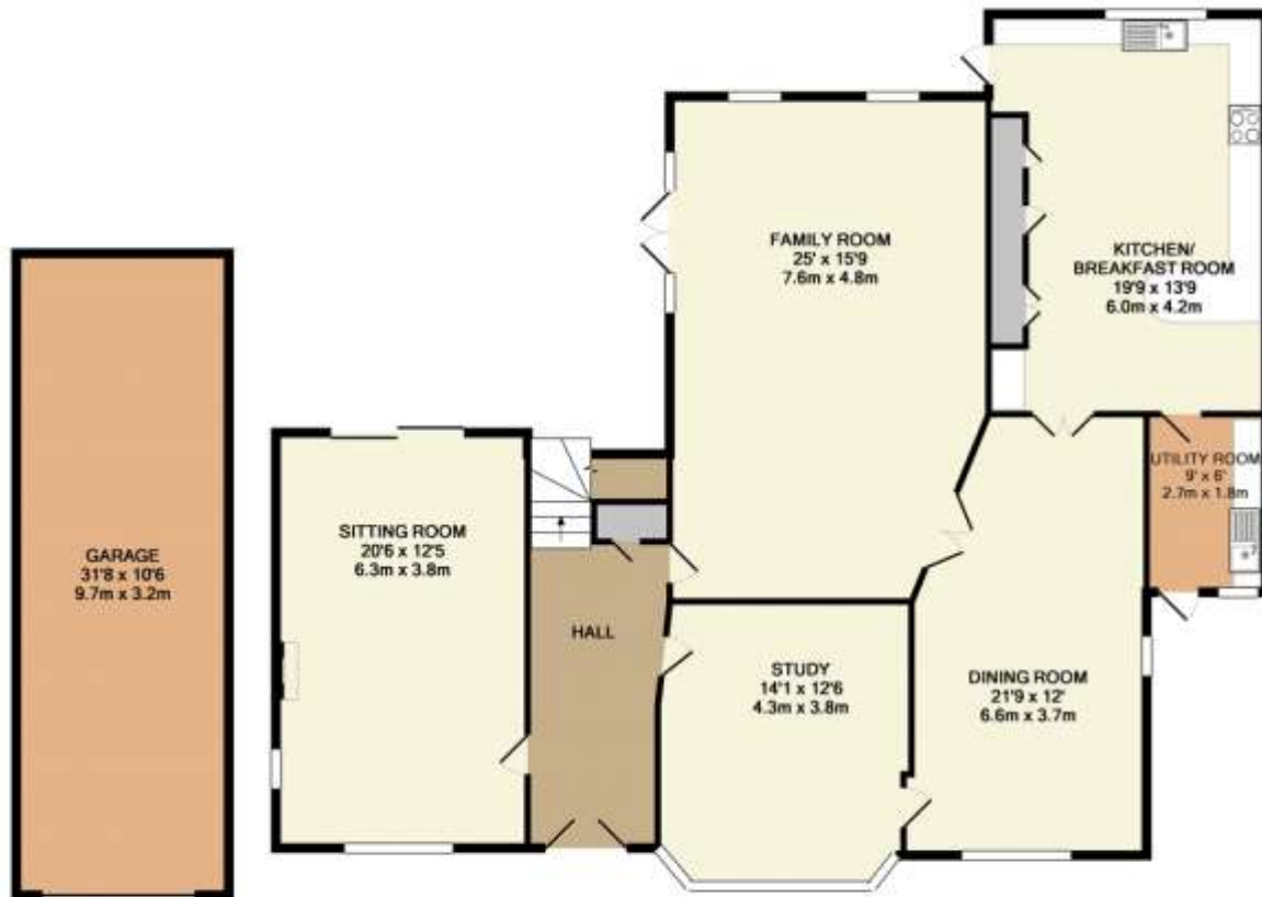
GROUND FLOOR APPROX. FLOOR AREA 1823 SQ.FT. (169.3 SQ.M.)