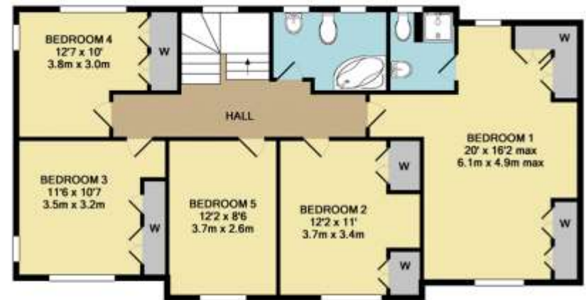
1ST FLOOR APPROX. FLOOR AREA 905 SQ.FT. (84.0 SQ.M.)

TOTAL APPROX. FLOOR AREA 2727 SQ.FT. (253.4 SQ.M.) Made with Mapsoft 102010