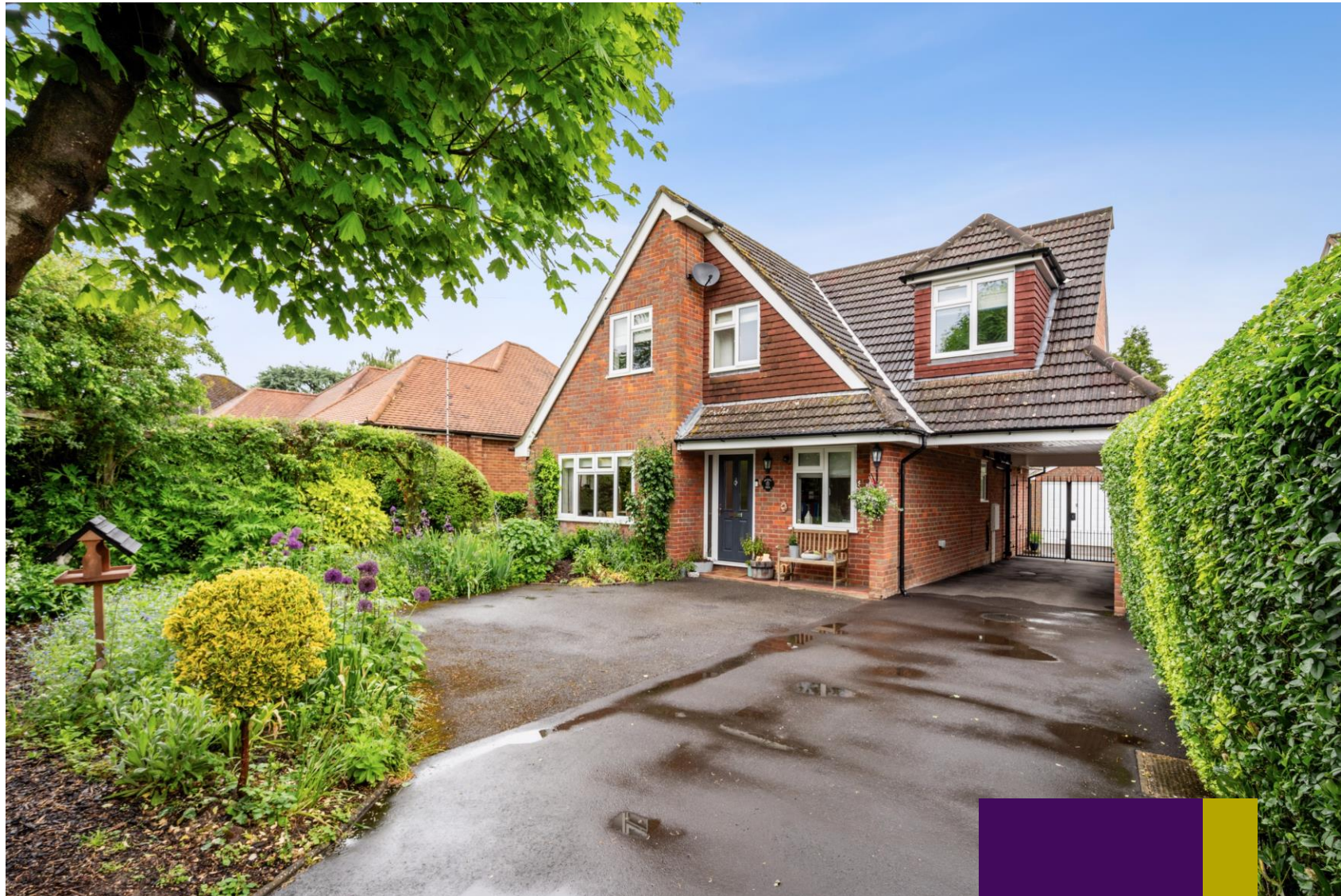
BOTTRELLS LANE, CHALFONT ST GILES