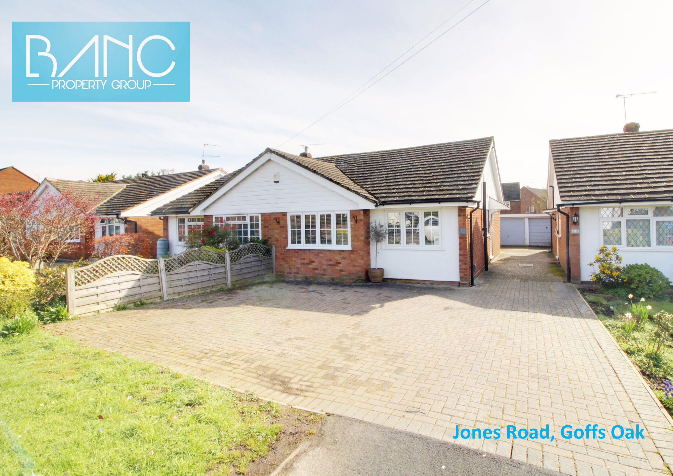
Jones Road, Goffs Oak