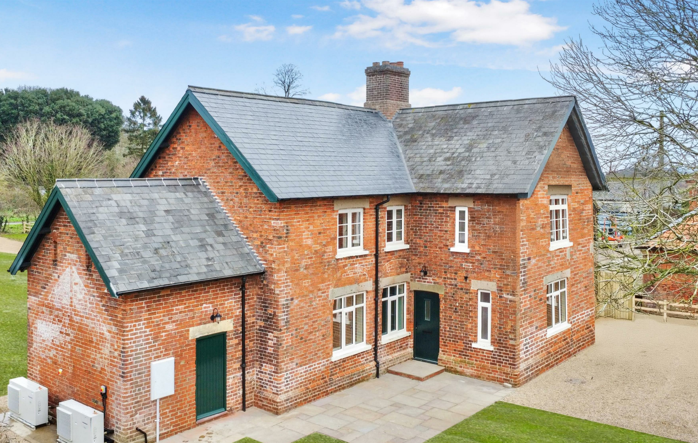
1 High Walks Cottage Haddington