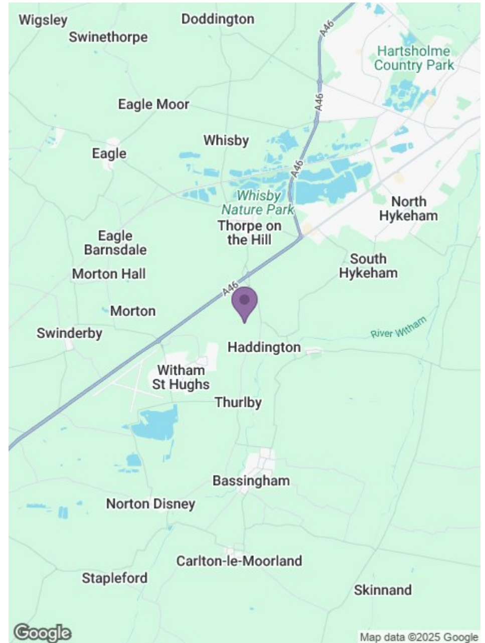
Illustration for identification purposes only, measurements are approximate, not to scale. Produced by Elements Property

Mount & Minster endeavour to provide accurate particulars, however they should not be relied upon as statements of fact. All the information provided should be verified by yourselves or your advisers. These particulars do not constitute any part of an offer or contract. Our staff have no authority to make or give any representation or warranty whatsoever in respect of the property. The services, fittings and appliances have not been tested and no warranty can be given as to their condition. Photographs may have been taken with a wide angle lens. Plans are for identification purposes only, are not to scale and do not constitute any part of the contract. Mount & Minster is the trading name of Mount & Minster LLP. Registered Office: Atton Place 32 Eastgate, Lincoln, LN2 1QA. Registered in England and Wales. Registration Number: OC398777