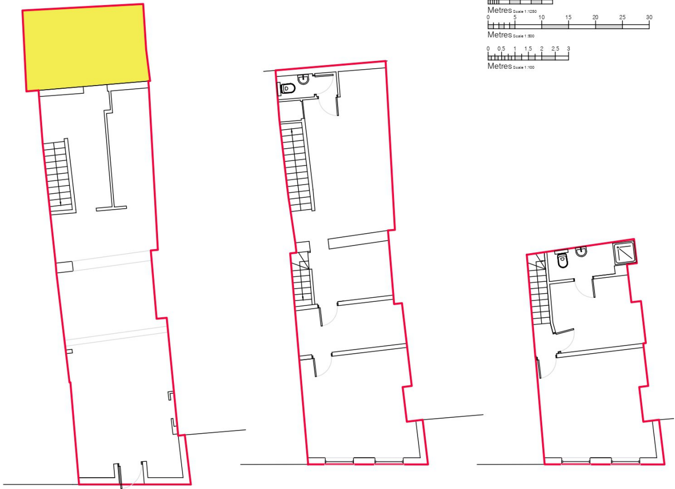
03 Ground Floor Plan Scale 1:100