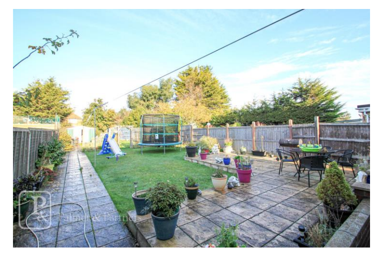
For additional information and full photo gallery please visit www.palmerpartners.com