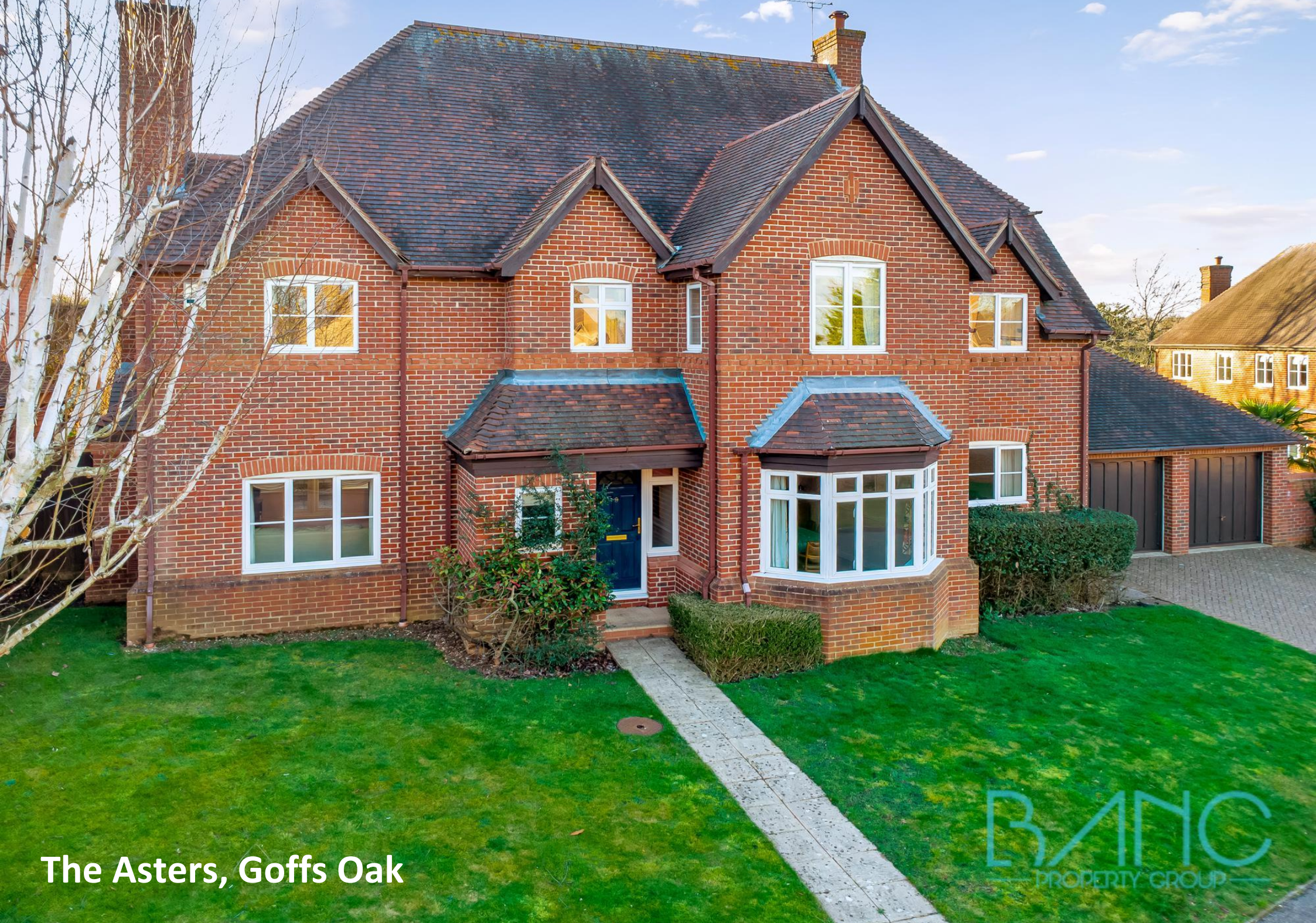
The Asters, Goffs Oak