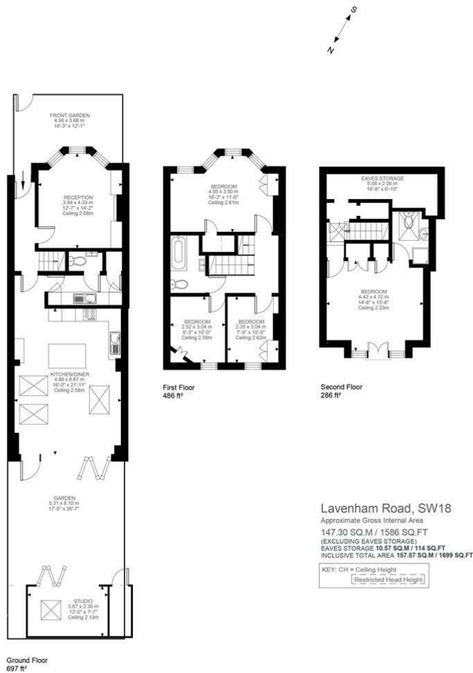
Illustration for identification purposes only. Not to scale. Floor Plan Drawn According To RICS Guidelines.