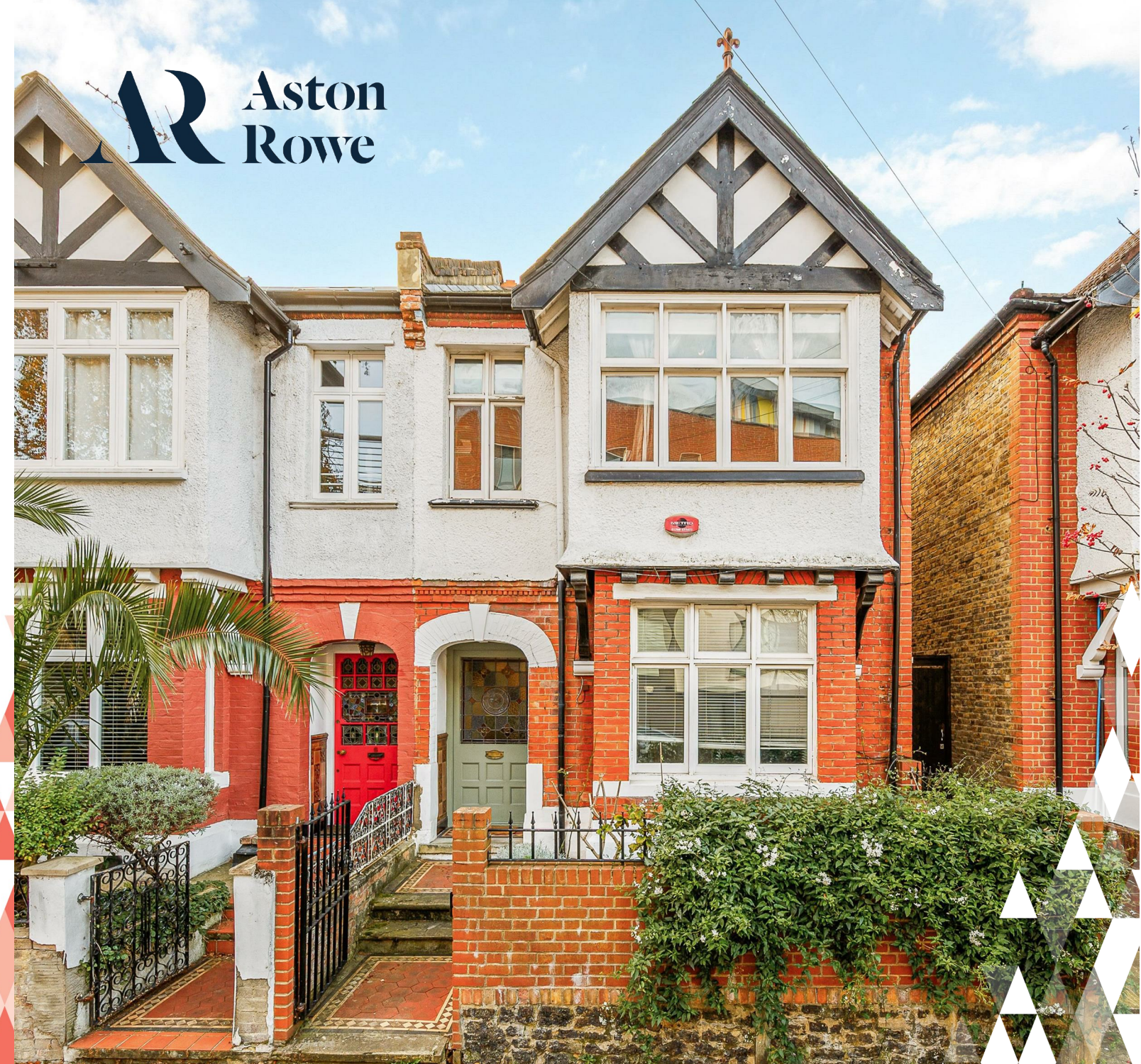
Denehurst Gardens Approximate Gross Internal Area = 156.0 sq m / 1679 sq ft