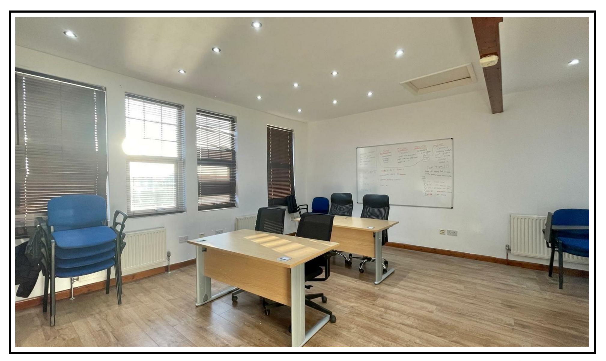
2nd Floor Office, 22 Aldermans Hill, Palmers Green, N13 4PN