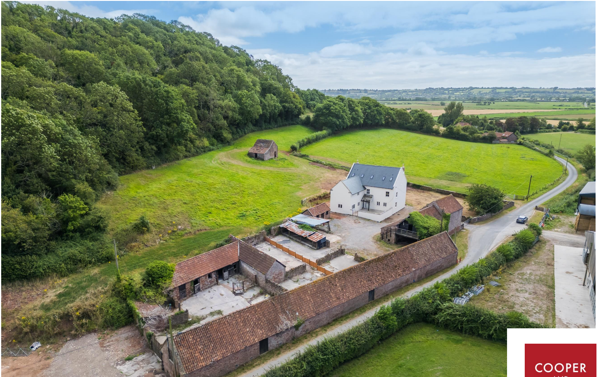
Decoy Pool Farm, Nyland, BS27 3UD