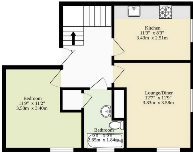
1st Floor 167 sq.ft. (15.6 sq.m.) approx.