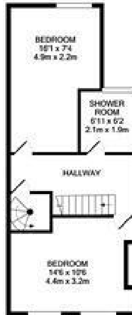
1ST FLOOR APPROX. FLOOR AREA 424 SQ.FT. (39.4 SQ.M.) TOTAL APPROX. FLOOR AREA 1002 SQ.FT. (111.7 SQ.M.) Made with Metastudio (2000)