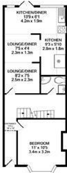
GROUND FLOOR APPROX. FLOOR AREA 500 SQ.FT. (46.4 SQ.M.)