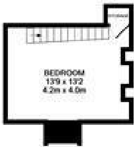
BASEMENT LEVEL APPROX. FLOOR AREA 149 SQ.FT. (13.8 SQ.M.)