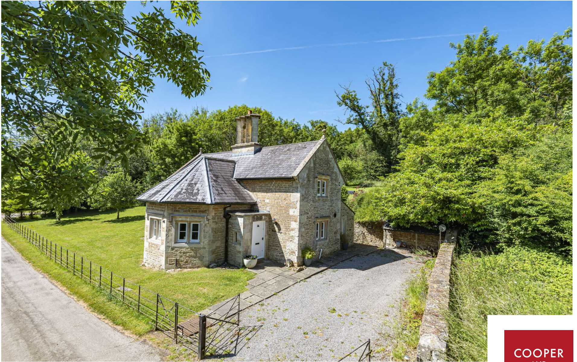
Temple Lodge, Orchardleigh, Frome, BA11 2PH