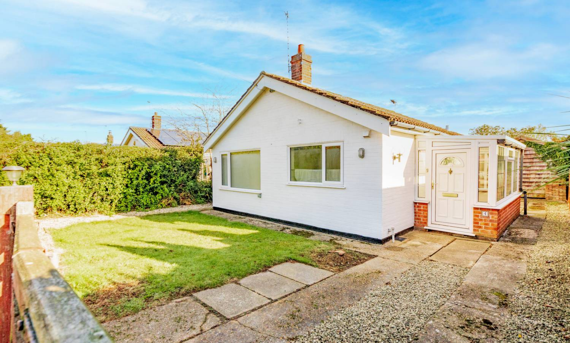
4 Grove Road, Repps With Bastwick £310,000