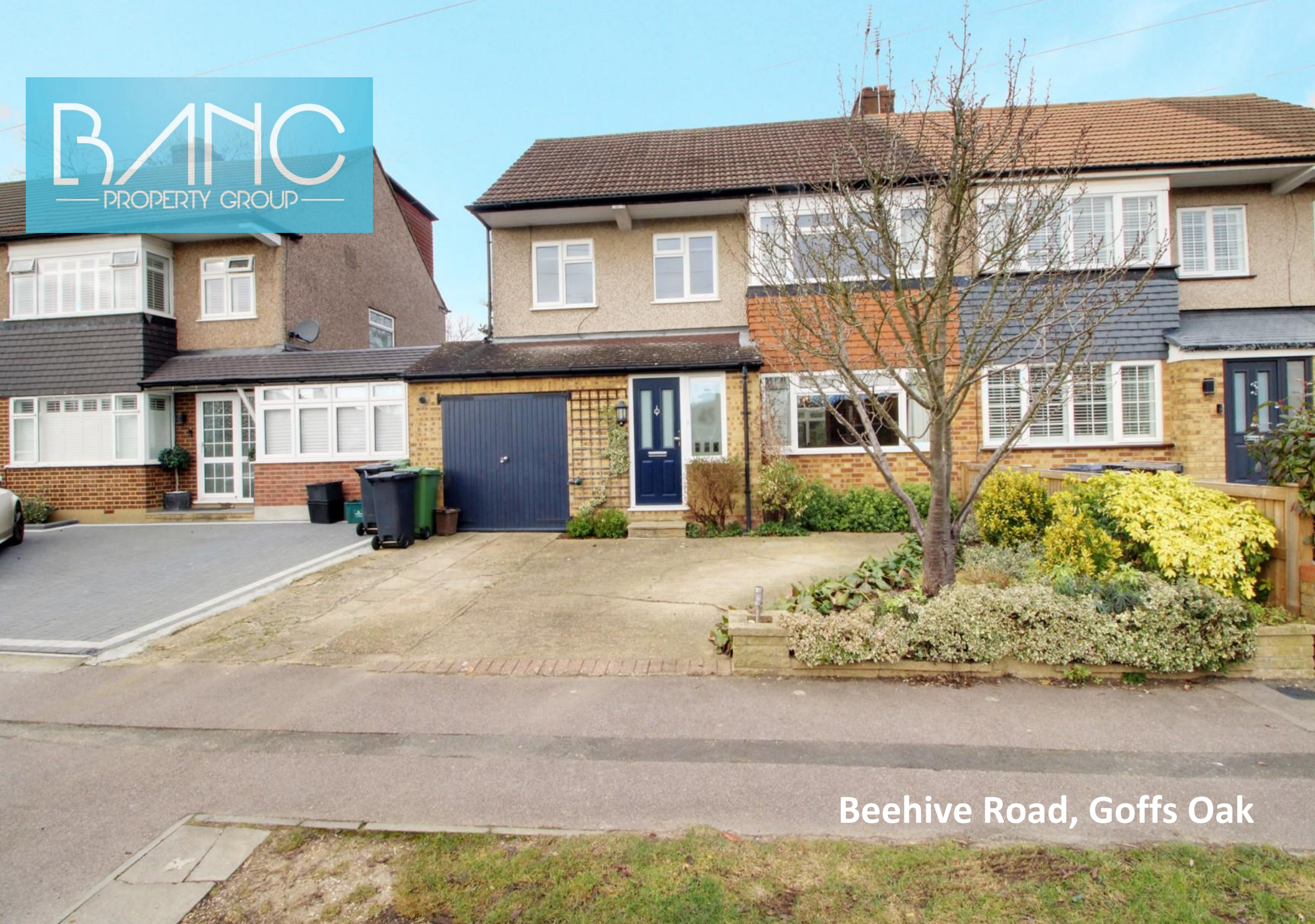
Beehive Road, Goffs Oak