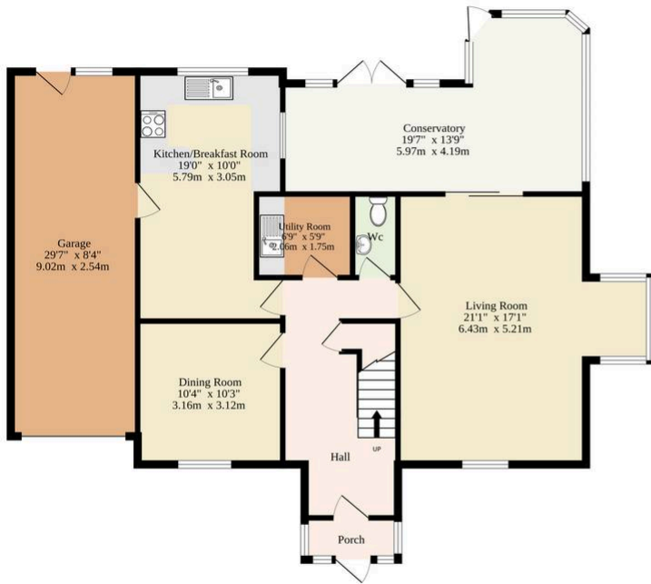
Ground Floor 1328 sq.ft. (123.4 sq.m.) approx.